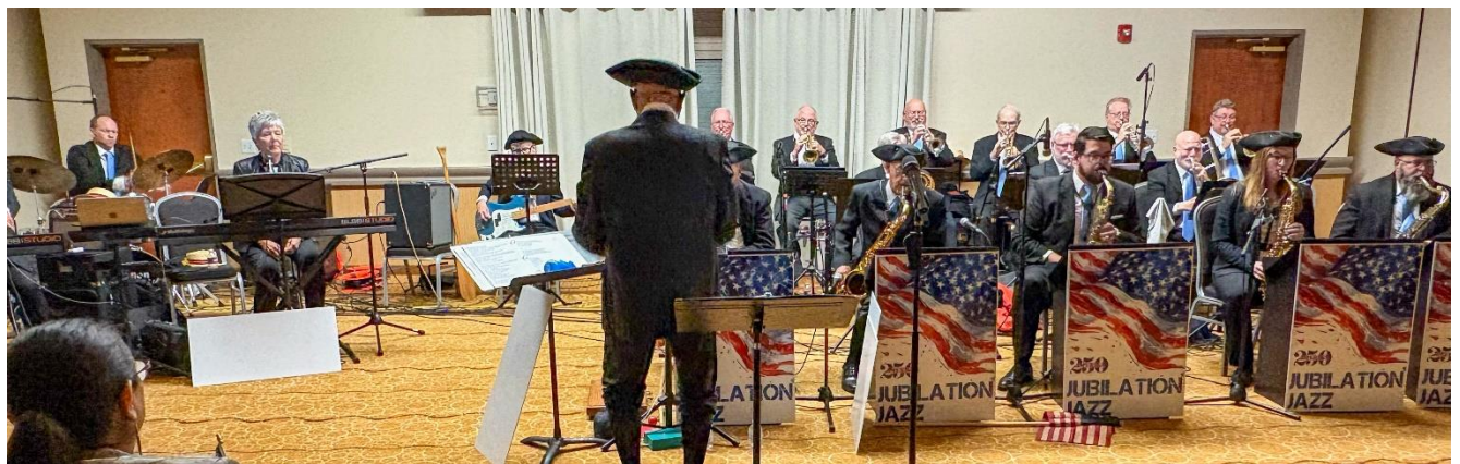
Jubilation Jazz Band presented several patriotic songs and were fantastic!