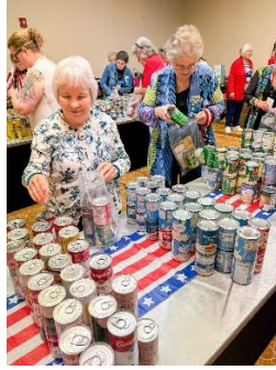
Members filling the bags