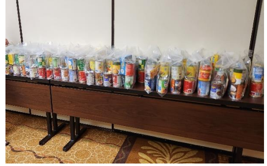
Finished meal kits ready to be boxed up and taken to the Air Museum