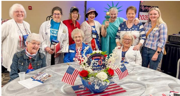
Club members on Fun Night