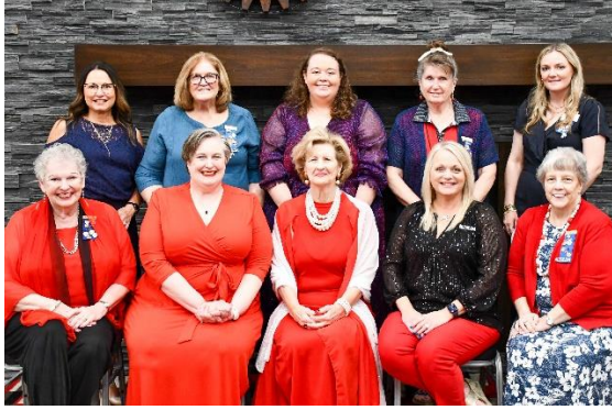
District Eight Board