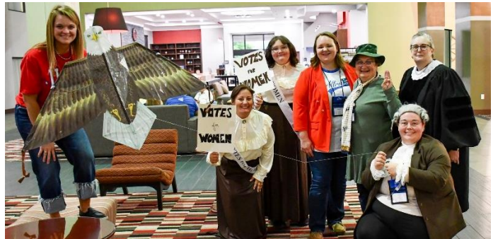
Costumes for Fun Night