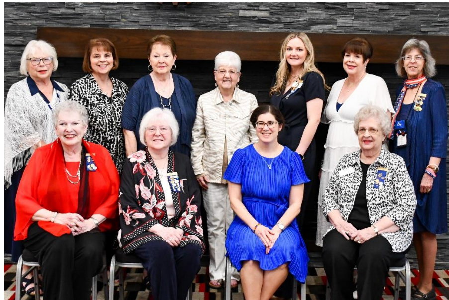
Saturday night banquet attire