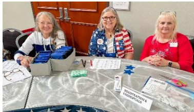
Registration table and patriotic decorations